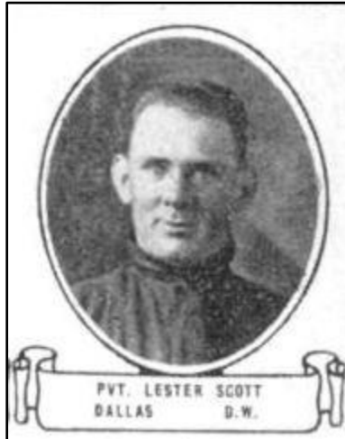
From Soldiers of the Great War – West Virginia